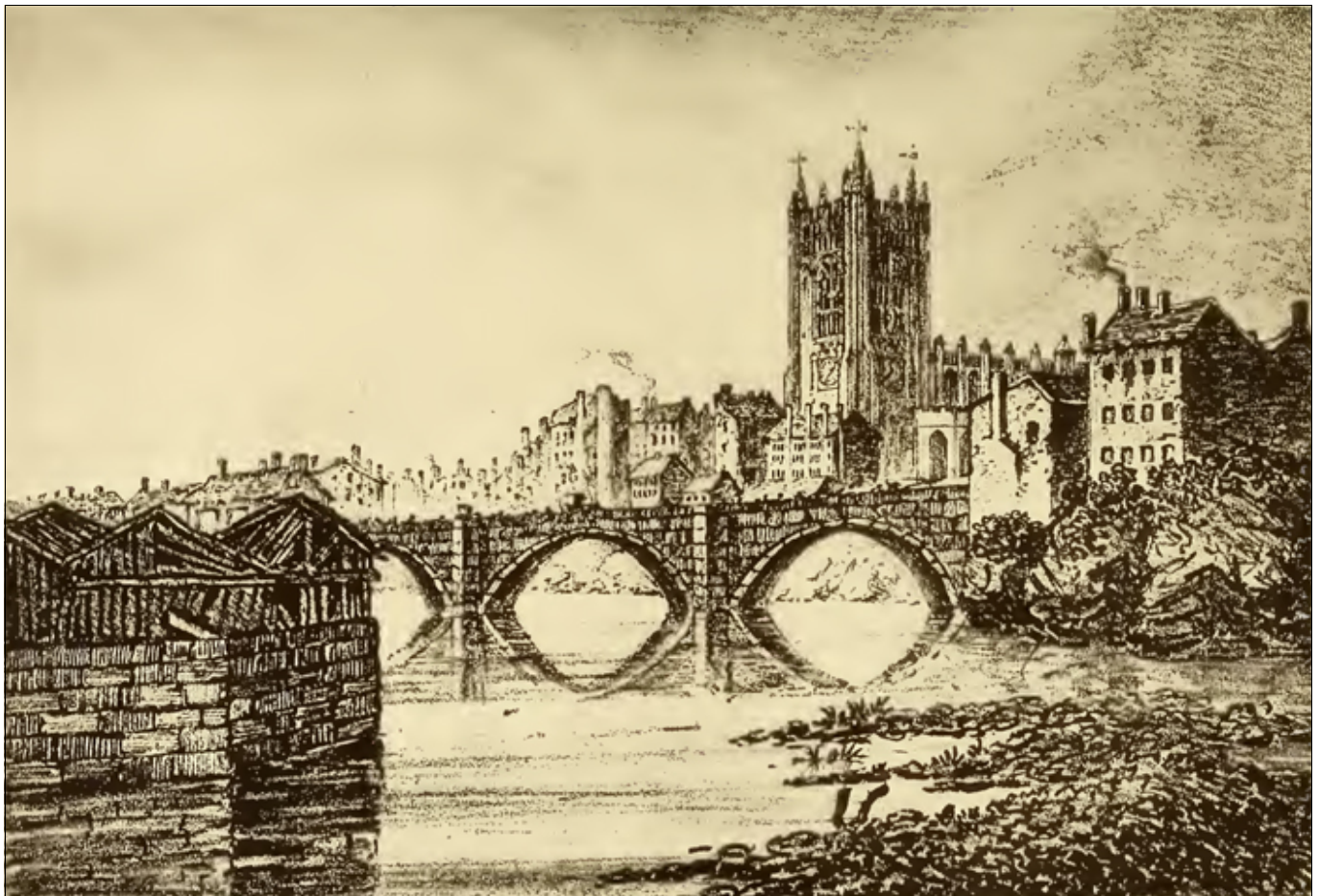
'Old Church and Bridge, from Blackfriars'. drawn 1825